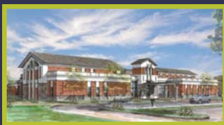
Clarence Brown Conference Center — Meet Green at Brown