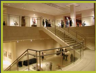
Booth Western Art Museum All New After Expansion