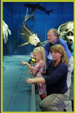
Tellus Science Museum